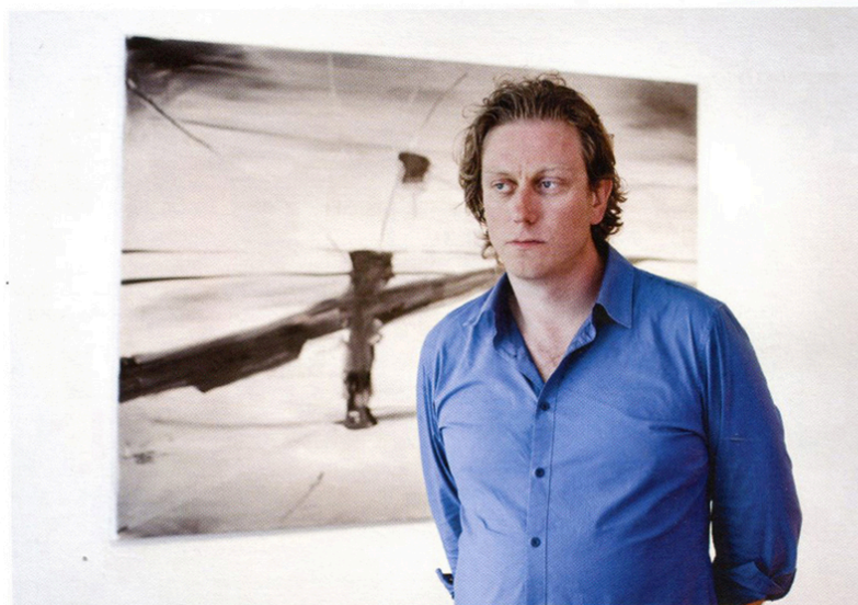
ABOVE: No Service , 2011. Oil on canvas, 105 x 157½ in.

Structures, whether in parts or whole, have long fascinated him. He started out studying engineering and architecture. After two years he switched subjects, enrolling at the Royal Academy of Fine Arts in Antwerp, but he has never stopped reflecting on the constructed realm. "When you think about it, the first architectural thing built was a road," he says. "The first thing to do is to get from point A to point B." He likes what he calls "in-between spaces"—a gutter, for instance—that you pass over when moving from here to there: "It's like a breathing space." Maybe there's more to see in those margins.